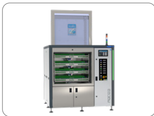
AQUBE® XH9 3-tank-systems