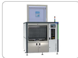
AQUBE® MH9 2-tank-systems