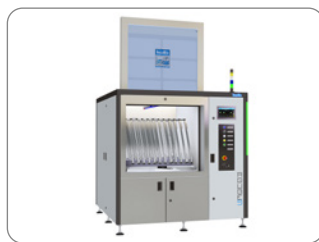
AQUBE® MH9 2-tank-systems