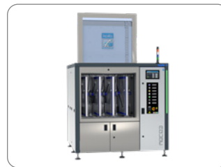
AQUBE® MV9 2-tank-systems

A closed rinsing circuit (ClosedLoop) is integrated into all kolb cleaning systems. Usually these are systems for product (PCBAs, DCBs, HDIs, etc.) or for tool cleaning (screens, stencils, solder frames / carriers, condensate filters, etc.). The rinsing water is repeatedly used in the ClosedLoop process (depending on the cycle number and the task options) until its dirt entry respectively its \mu\text{S} conductance is so high that it is no longer usable and has to be disposed. The cheapest disposal is the indirect introduction into the public sewage network. This may only be done with regard to the legal limit values! The operator is responsible for compliance with the local regulations, possible authorizations by the authorities and proper operation.