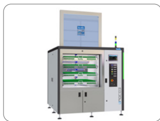
AQUBE® XH9 3-tank-systems