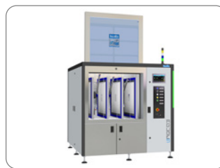
AQUBE® MV9 2-tank-systems

A closed rinsing circuit is integrated into all kolb cleaning systems. Usually these are systems for product (PCBs, DCBs, HDIs, etc.) or for tool cleaning (screens, stencils, solder frames / carriers, condensate filters, etc.). The rinsing water is repeatedly used in the ClosedLoop process (depending on the cycle number and the task options) until its dirt entry respectively its \mu\text{S} conductance is so high that it is no longer usable and has to be disposed. The cheapest disposal is the indirect introduction into the public sewage network. This may only be done with regard to the legal limit values! The operator is responsible for compliance with the local regulations, possible authorizations by the authorities and proper operation.