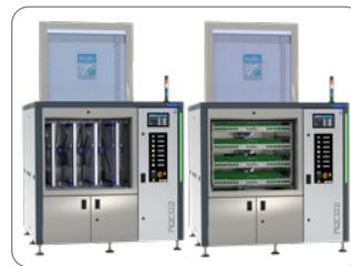
AQUBE® x9 systems

A closed rinsing circuit (ClosedLoop) is integrated into all kolb cleaning systems. Usually these are systems for product (PCBAs, DCBs, HDIs, etc.) or for tool cleaning (screens, stencils, solder frames / carriers, condensate filters, etc.). The rinsing water is repeatedly used in the ClosedLoop process (depending on the cycle number and the task options) until its dirt entry respectively its \mu\text{S} conductance is so high that it is no longer usable and has to be disposed. The cheapest disposal is the indirect introduction into the public sewage network. This may only be done with regard to the legal limit values! The operator is responsible for compliance with the local regulations, possible authorizations by the authorities and proper operation.