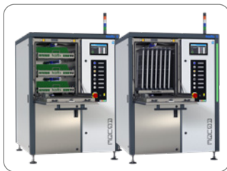
AQUBE® x6 systems