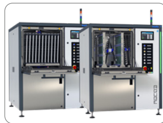
AQUBE® x7 systems