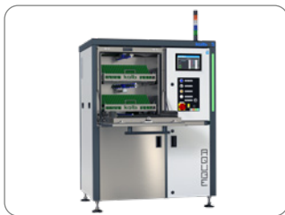
AQUBE® LH5 systems

A closed rinsing circuit (ClosedLoop) is integrated into all kolb cleaning systems. Usually these are systems for product (PCBAs, DCBs, HDIs, etc.) or for tool cleaning (screens, stencils, solder frames / carriers, condensate filters, etc.). The rinsing water is repeatedly used in the ClosedLoop process (depending on the cycle number and the task options) until its dirt entry respectively its \mu\text{S} conductance is so high that it is no longer usable and has to be disposed. The cheapest disposal is the indirect introduction into the public sewage network. This may only be done with regard to the legal limit values! The operator is responsible for compliance with the local regulations, possible authorizations by the authorities and proper operation.