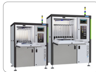
AQUBE® MH5, MH7 2-tank systems

A closed rinsing circuit is integrated into all kolb cleaning systems. Usually these are systems for product (PCBs, DCBs, HDIs, etc.) or for tool cleaning (screens, stencils, solder frames / carriers, condensate filters, etc.). The rinsing water is repeatedly used in the ClosedLoop process (depending on the cycle number and the task options) until its dirt entry respectively its \mu\text{S} conductance is so high that it is no longer usable and has to be disposed. The cheapest disposal is the indirect introduction into the public sewage network. This may only be done with regard to the legal limit values! The operator is responsible for compliance with the local regulations, possible authorizations by the authorities and proper operation.