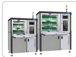
AQUBE® LH5, LH7 2-tank systems