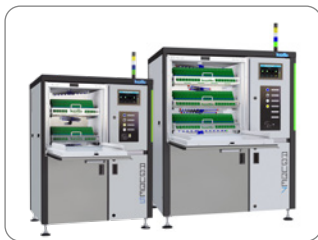
AQUBE® XH5, XH7 3-tank systems