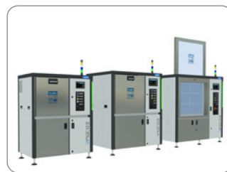
AQUBE® M series