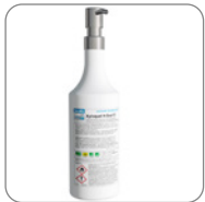
Bottle with stainless steel dispenser