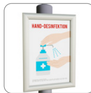
DIN A4 snap frame