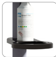
Integrated drip tray