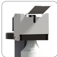
Theft protection and fixation