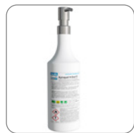
Bottle with stainless steel pump head

The mounted A4 snap frame is delivered with an illustrated poster (in English), which can be replaced by your own information signs.